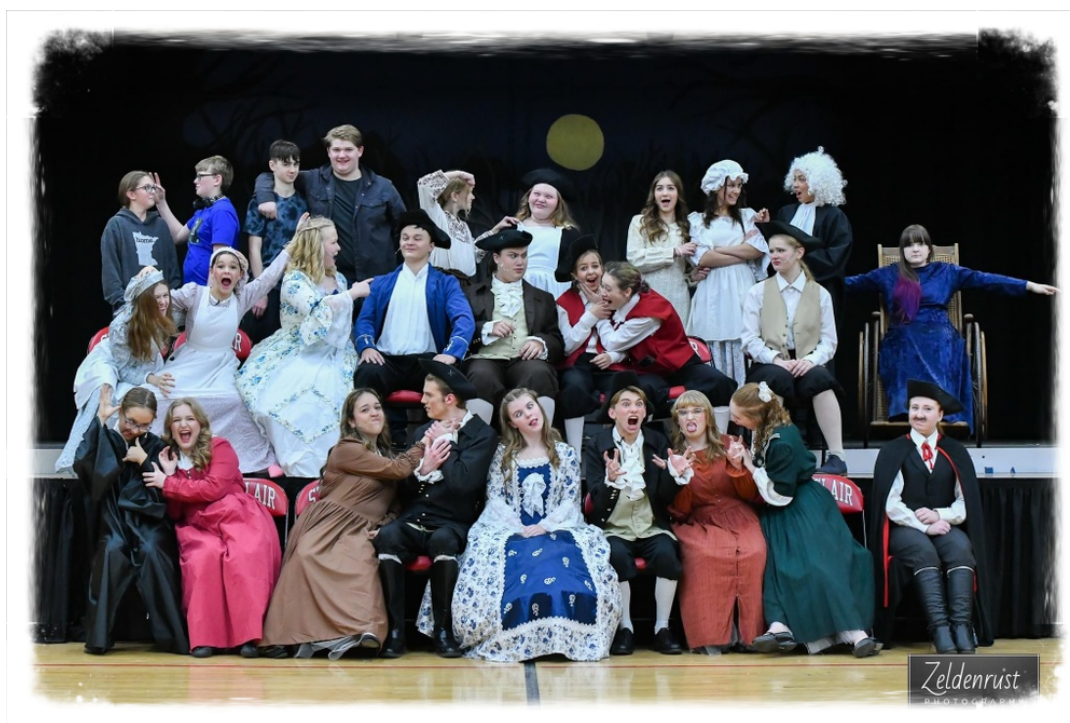
Cast & Crew of Cyclone Theater's fall production of "The Headless Horseman."