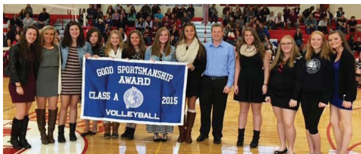
Class A: Windham High School