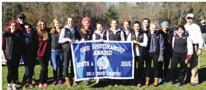
Girls Class A South: Windham High School