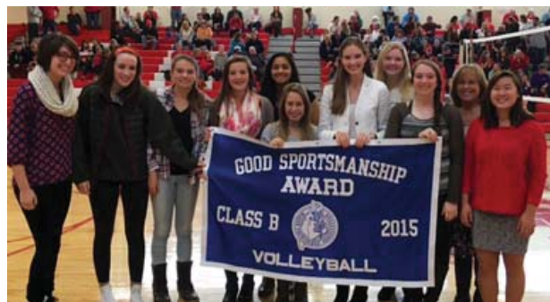
Class B: North Yarmouth Academy