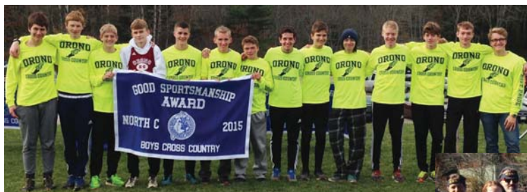
Boys Class C North: Orono High School