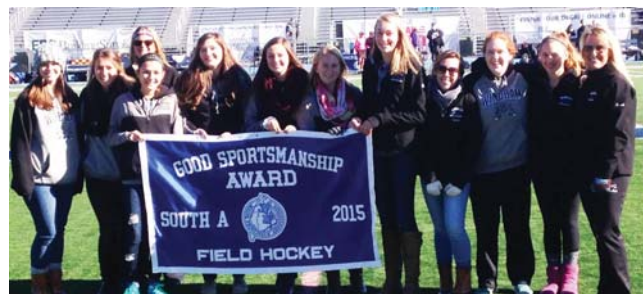
Class A South: Windham High School