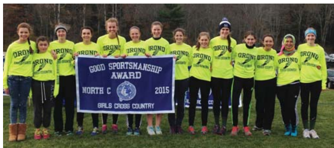
Girls Class C North: Orono High School