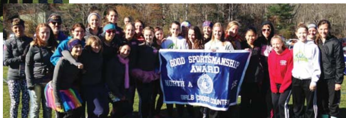
Girls Class A North: Cony and Mt. Blue High Schools