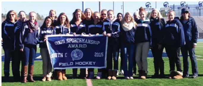
Class C South: Dirigo High School