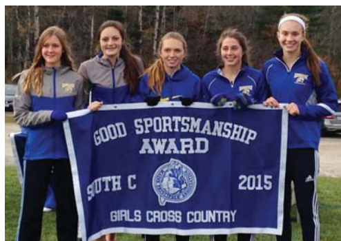
Girls Class C South: Boothbay Region High School