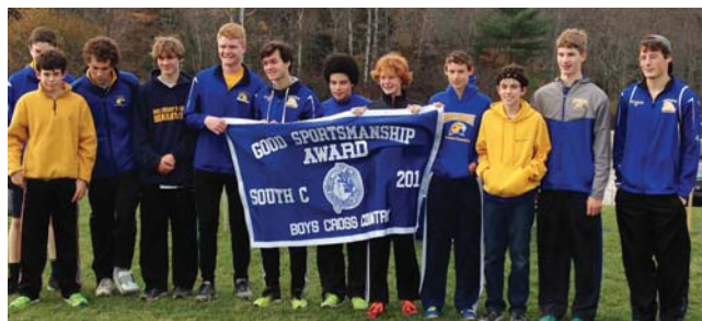
Boys Class C South: Boothbay Region High School