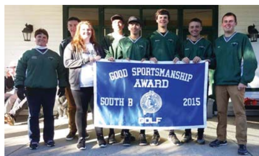
Class B South: Spruce Mountain High School