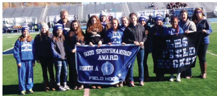
Class A North: Lewiston High School