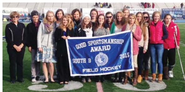
Class B South: Lincoln Academy