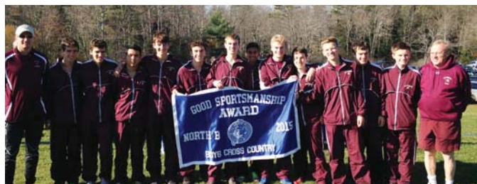
Boys Class B North: Caribou High School