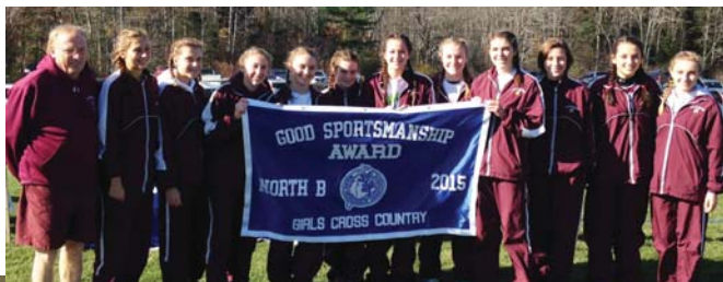
Girls Class B North: Caribou High School