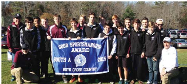
Boys Class A South: Windham High School