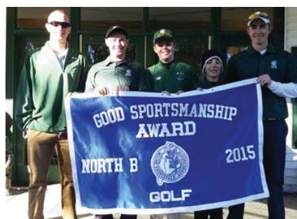
Class B North: Mount Desert Island Regional High School