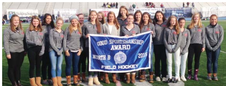
Class B North: Camden Hills Regional High School