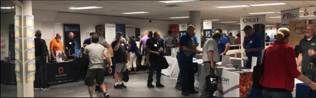
West Event | Alexandria June 27th 105 Attendees

Thank you to the Eden Prairie ISD, Crosby-Ironton ISD, Red Wing ISD and Alexandria ISD For hosting the events. Their staff helped with setup and provided the meals. Hats off to them, as each event was great!