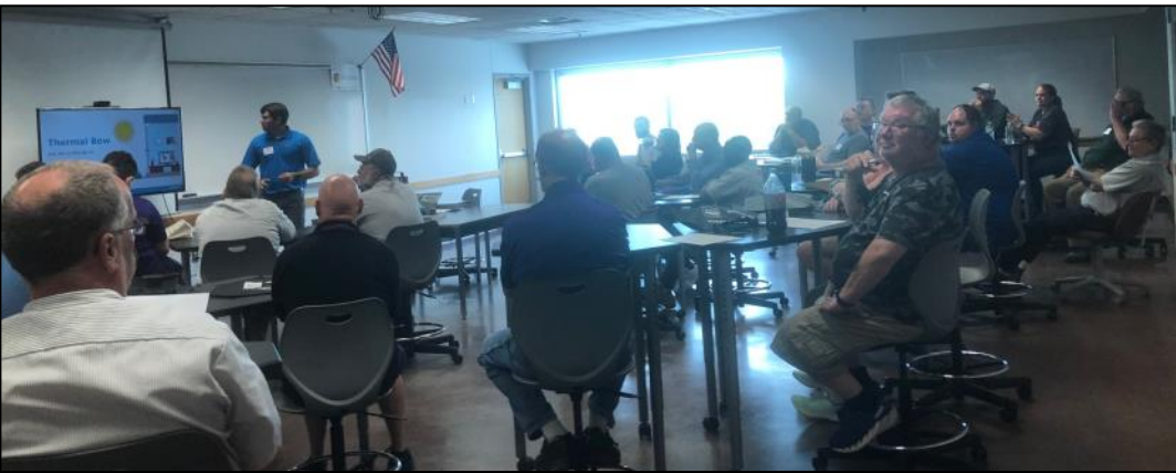
Metro Event | Eden Prairie June 13th & 14th 313 Attendees