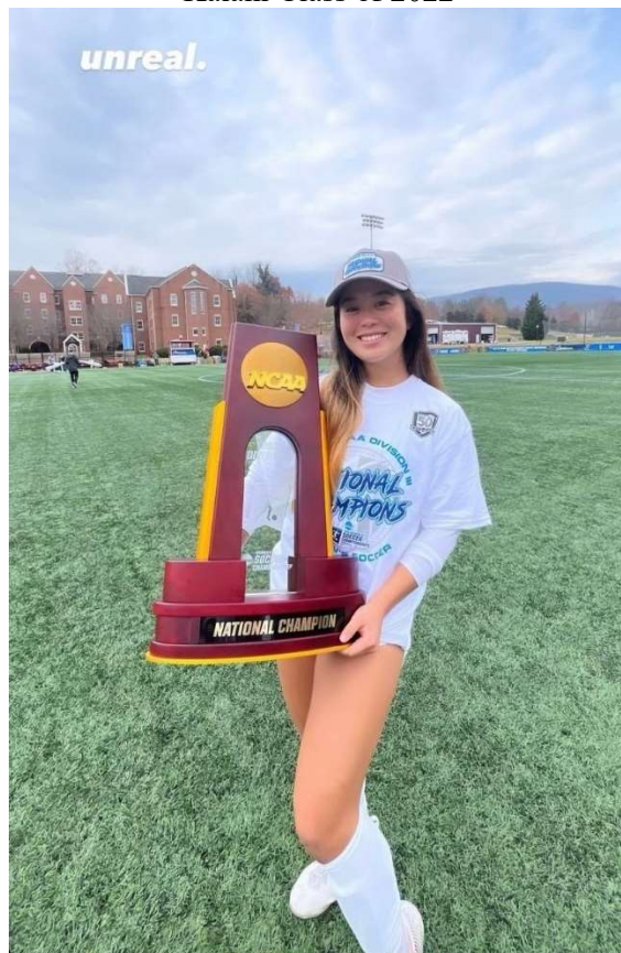
Cal Lutheran National Champions NCAA DIII Women's Soccer