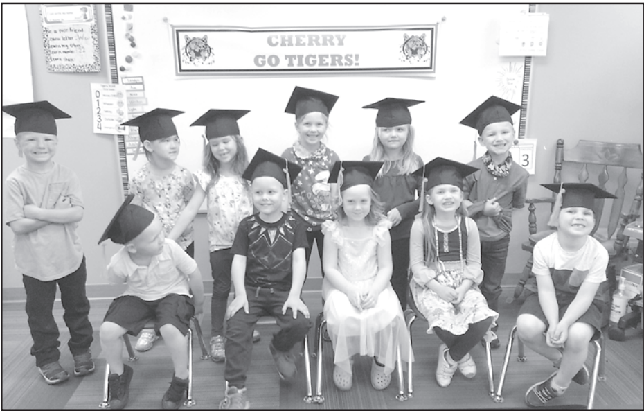
Preschoolers at Cherry School celebrated the end of the 2020-2021 school year with a graduation ceremony. The children sang songs, received their diplomas, and enjoyed a special snack. Parents and family members joined virtually to watch the excitement the ceremony brought.