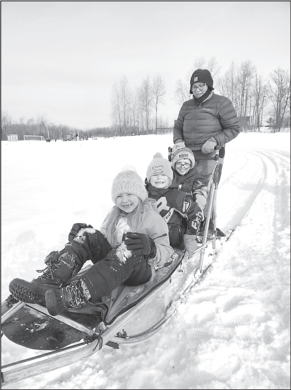
Students from first grade were ready to take their ride.

VISIT OUR PARENTING RESOURCE PAGE AT http://www.isd2142.net/page/3003