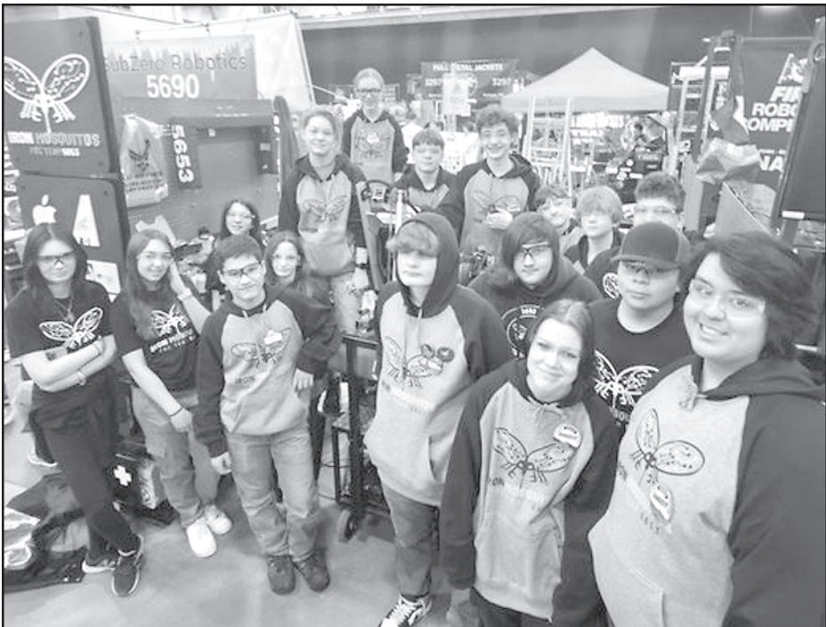
The Northeast Range Iron Mosquitos FIRST Robotics team is headed to Texas for "Worlds" competition after winning the prestigious FIRST Impact Award at regional competition in Duluth.