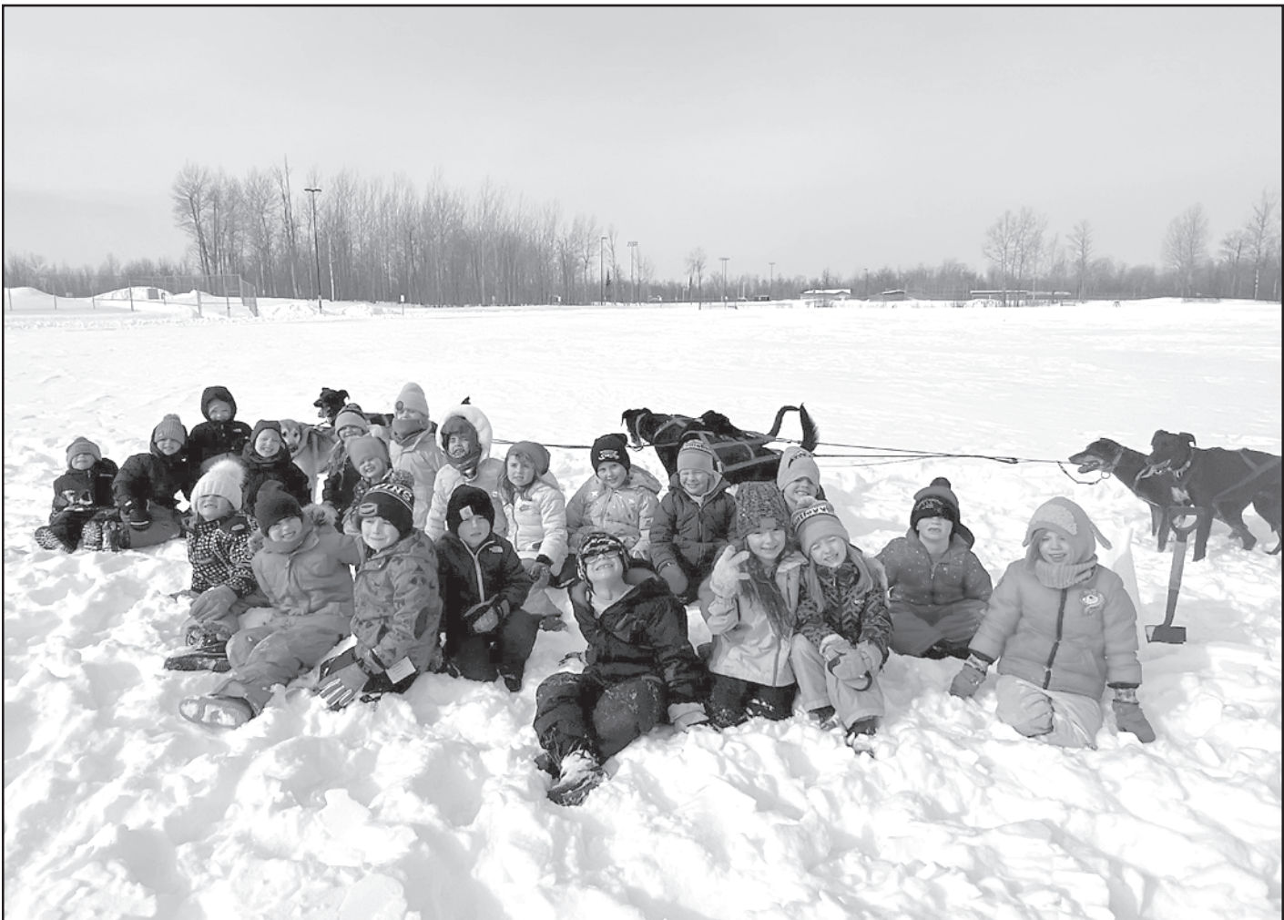
Students were happy to pose for a picture with their favorite dog sled team.