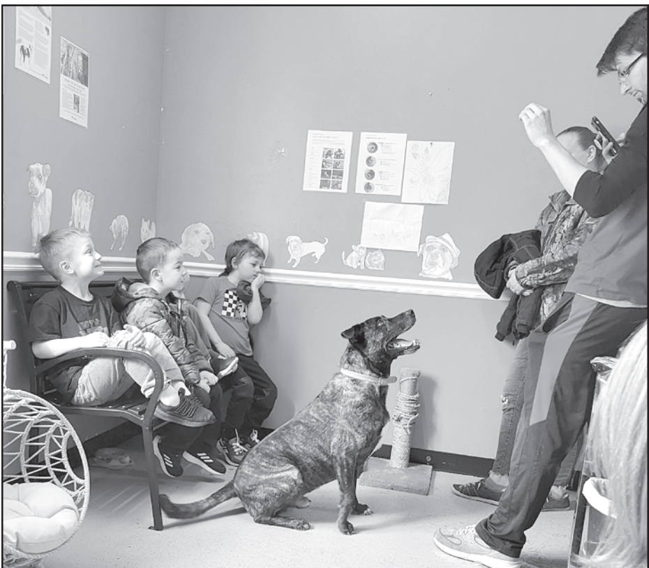
Cherry preschoolers recently participated in and completed a pet study. They learned about various pets, what pets need, and how to care for them. Children shared photos of their pets and made a class pet book. At the conclusion of the study, the class went to Range Regional Animal Rescue to visit the animals and to bring donations of food, toys, etc.