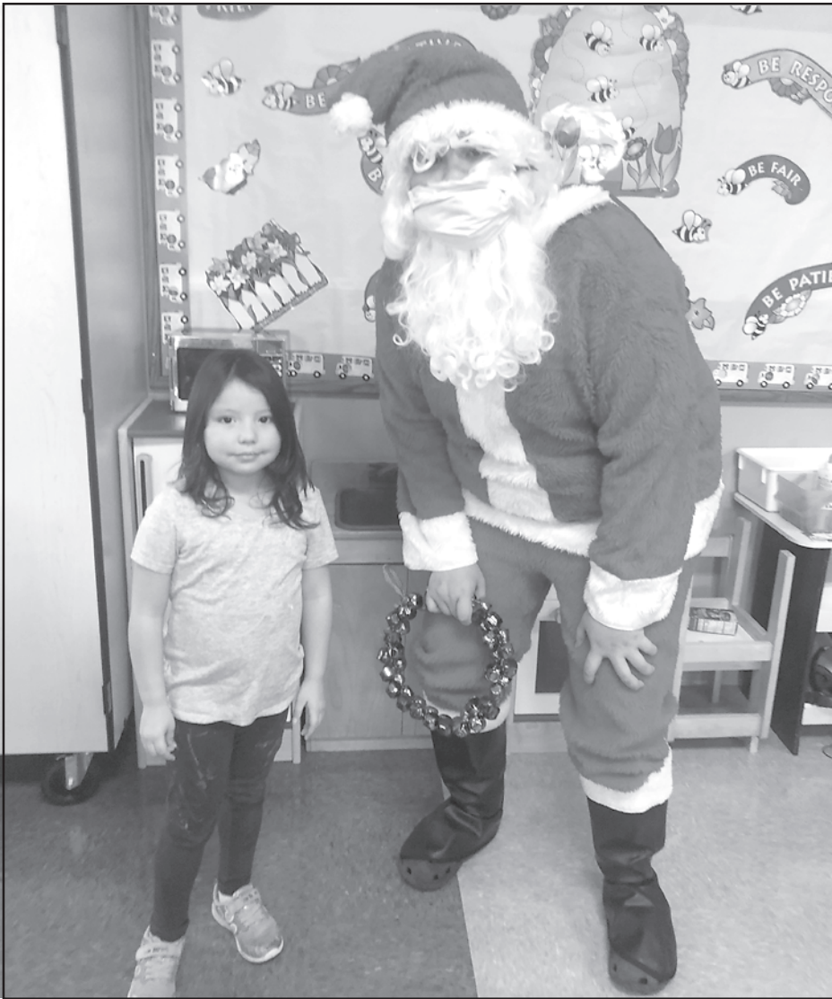
Early Childhood Family Education programs even include visits with Santa Claus!