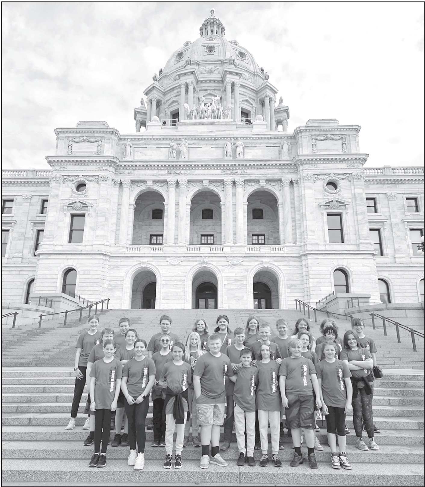
The sixth-grade class from South Ridge School on the steps of the Capitol building. (See another trip photo on page 5)

Students also had the opportunity to climb the Round Tower, which is considered to be the state’s oldest standing building, and look out over the fort, the