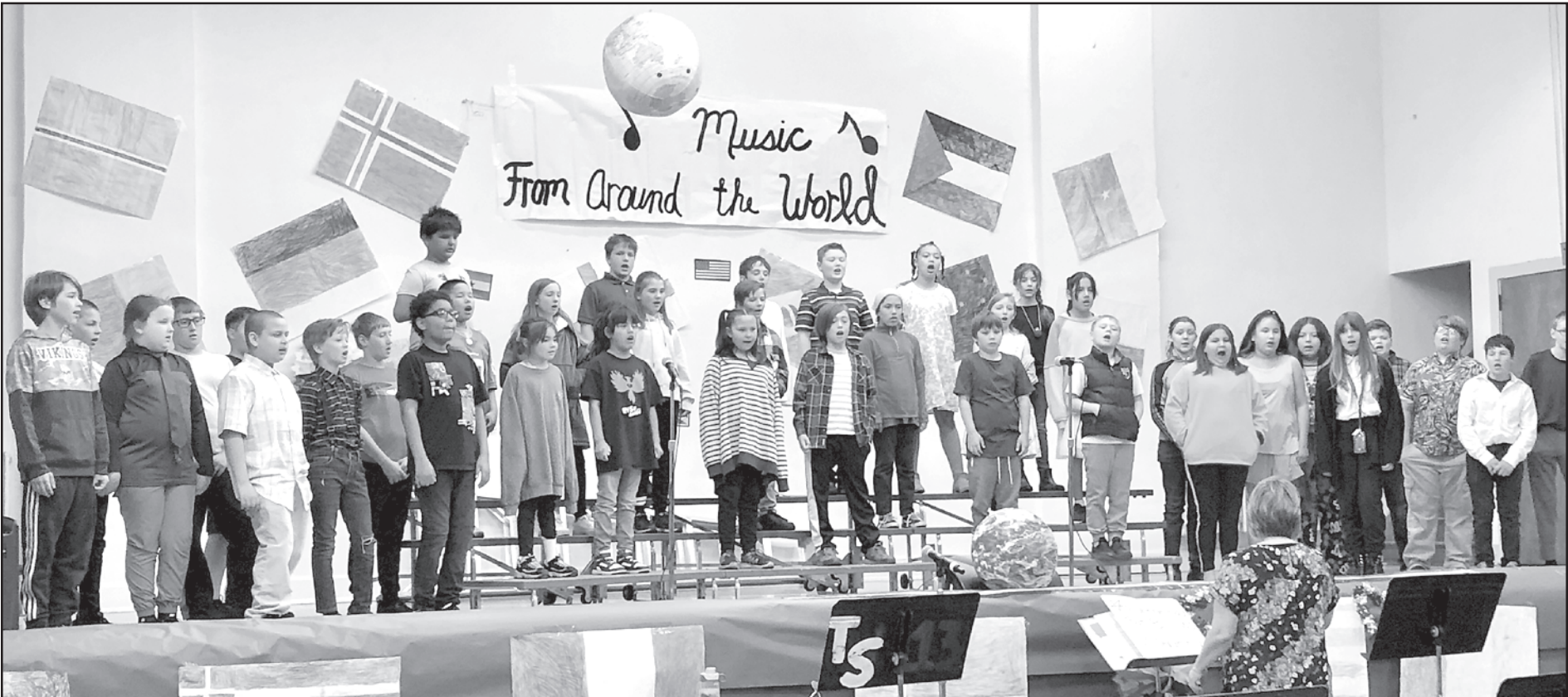
Older students at T-S sing the song, "Fifty Nifty United States."

The students at Tower-Soudan Elementary put on quite a show in May for a full house. Each group of students performed songs and dances from around the world. Many of the songs were sung in different languages. Students also shared facts with the audience about the different countries that the songs originated from. Great job, Golden Eagles!!