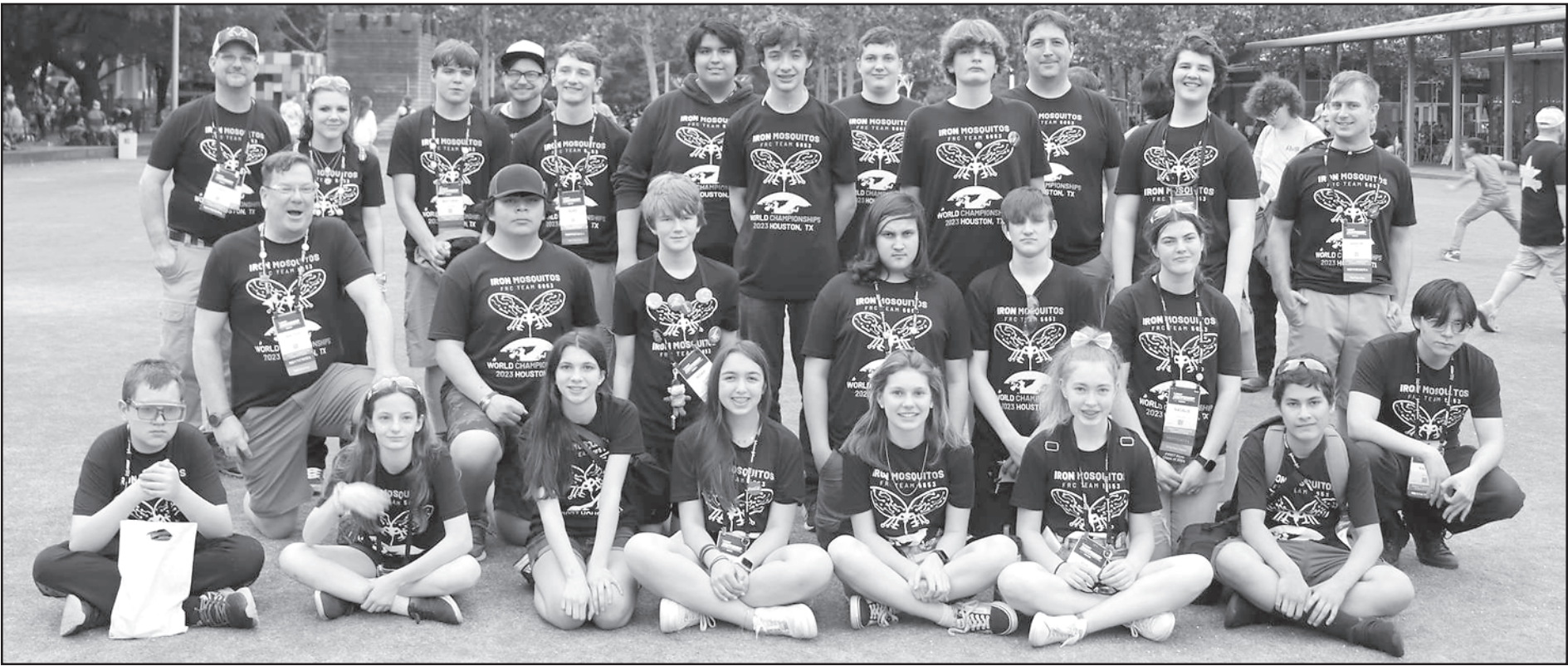
The Iron Mosquitos Robotics Team from Northeast Range (pictured above) wrapped up an amazing competition season finishing on the 4th place Alliance