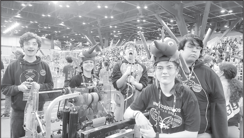
Pictured here is the Iron Mosquitos drive team.