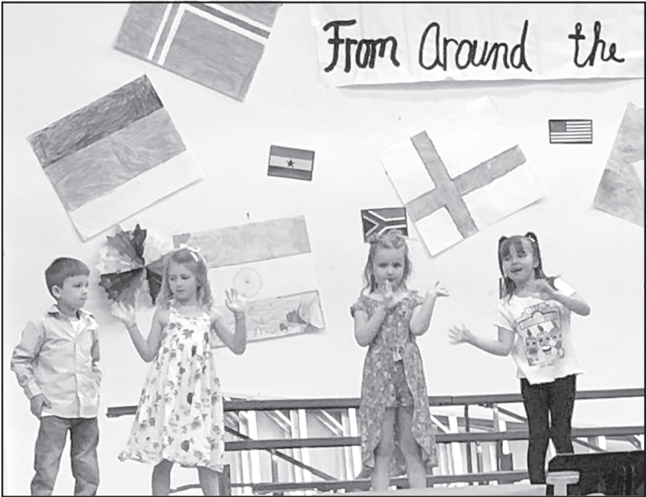
T-S kindergarten students perform the "Mexican Hat Dance."

Students had to read books and take AR quizzes to earn 40 points. Kindergarten and first-grade students had to read 900 minutes. Their pictures are posted in the main hall at the school. Cherry School is so proud of its Reading Tigers!!!