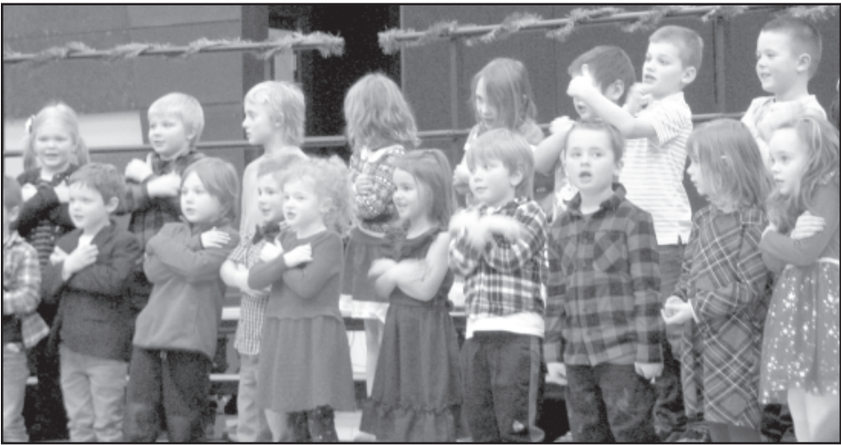
Kindergarteners sang “I’m a Little Snowflake.”