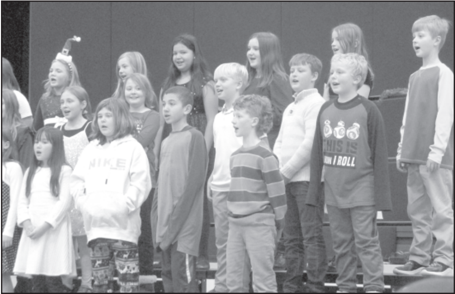
“Twelve Days of Christmas” was sung by North Woods fourth-graders.