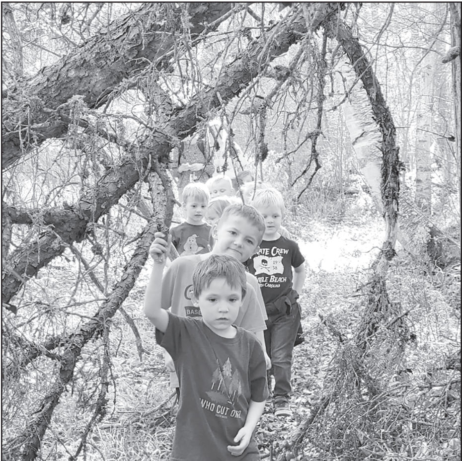
Cherry preschoolers took advantage of the late Fall warm temperatures to spend time exploring the School Forest. They followed trails, climbed on tree stumps, and explored some shelters that older students made out of sticks, logs, and moss.