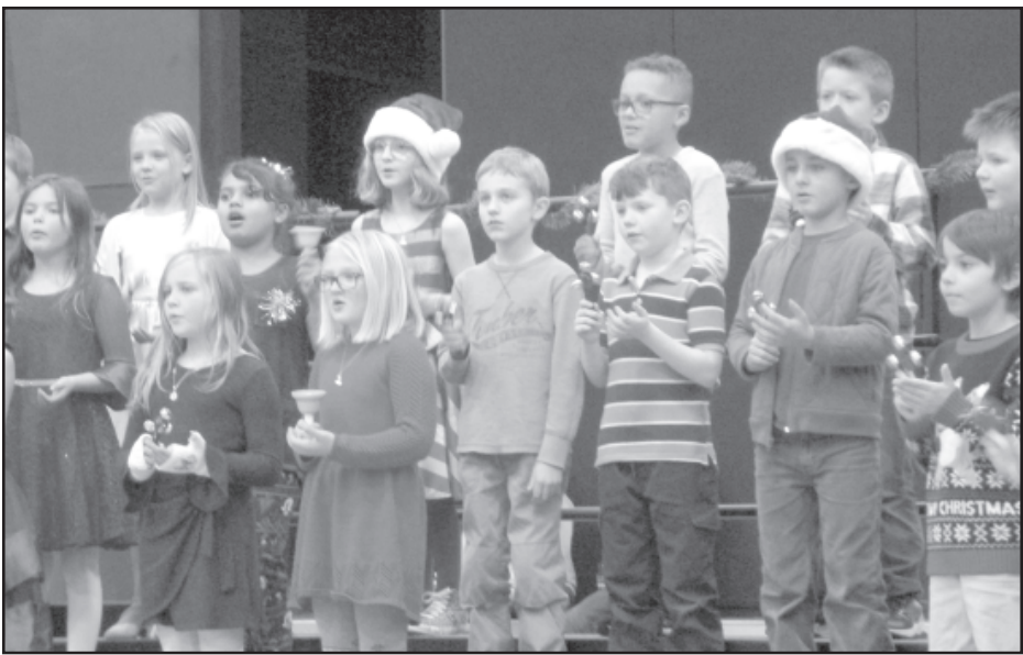
Second-graders sang “Jingle Jive.”