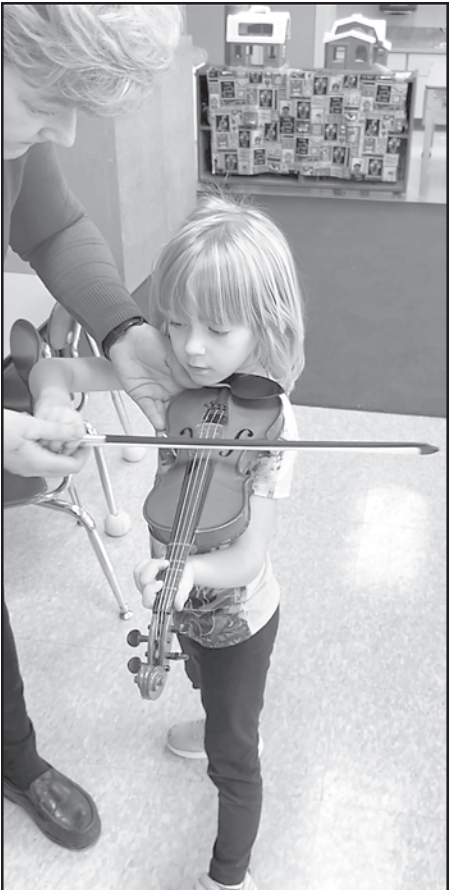
The North Woods Learning Readiness Preschool students had a fun opportunity to listen to some classical Christmas music performed by a member of the DSSO (Duluth Superior Symphony Orchestra). Children had a chance to play along to some of the songs with bells. In addition, they got to learn about a violin and a viola as well as having the opportunity to experiment with a violin just the right size for them! The students had a great time trying to hold the violin, pluck the strings and even use a bow!

"Small Schools With Big Opportunities -- Where Everybody is Somebody!"