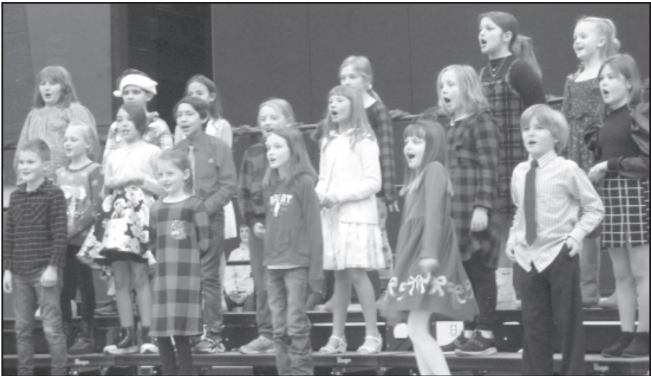
Third-graders sang “Blitzen’s Boogie.”