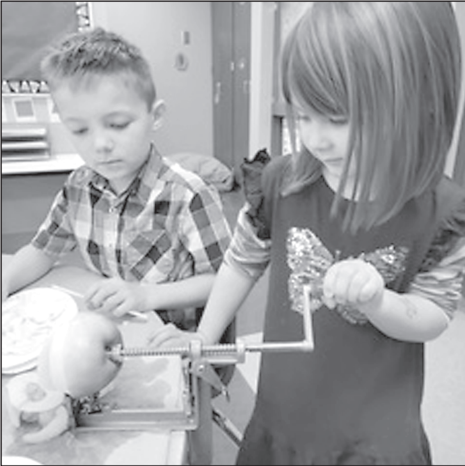
Preschoolers at the Cherry School had a busy day peeling and cutting up apples to make applesauce for a special snack. They enjoyed the aroma of the apples cooking. The activity tied in nicely with a special study students are doing on exercising and talking about healthy bodies and making their muscles strong. They learned that apples are a healthy snack and provide nutrients for their bodies. They also learned they need to have strong arm muscles in order to turn the handle to peel and de-core the apples.