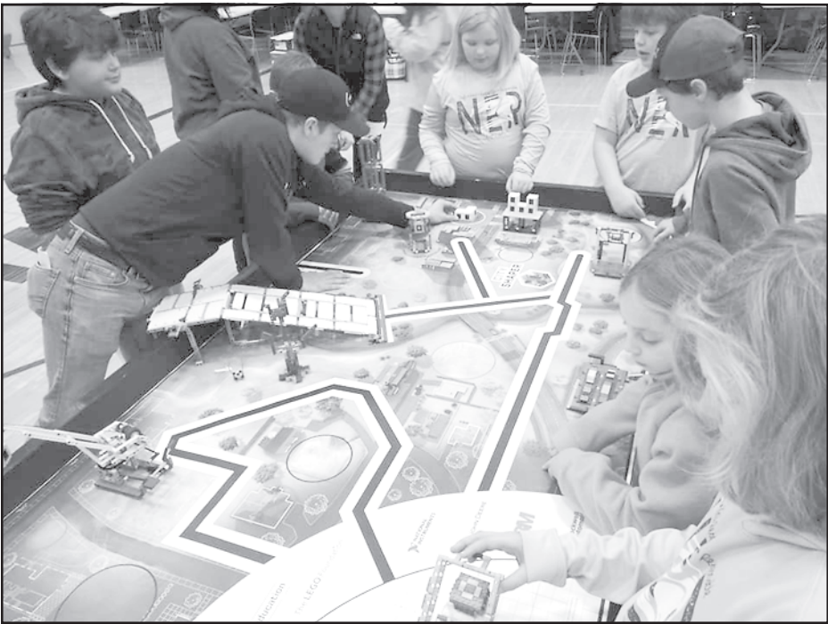
Lego practice table.