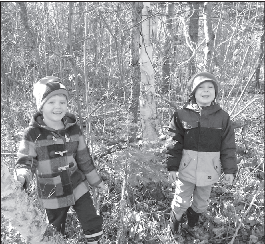
Cherry School preschool students enjoyed studying about trees this fall.