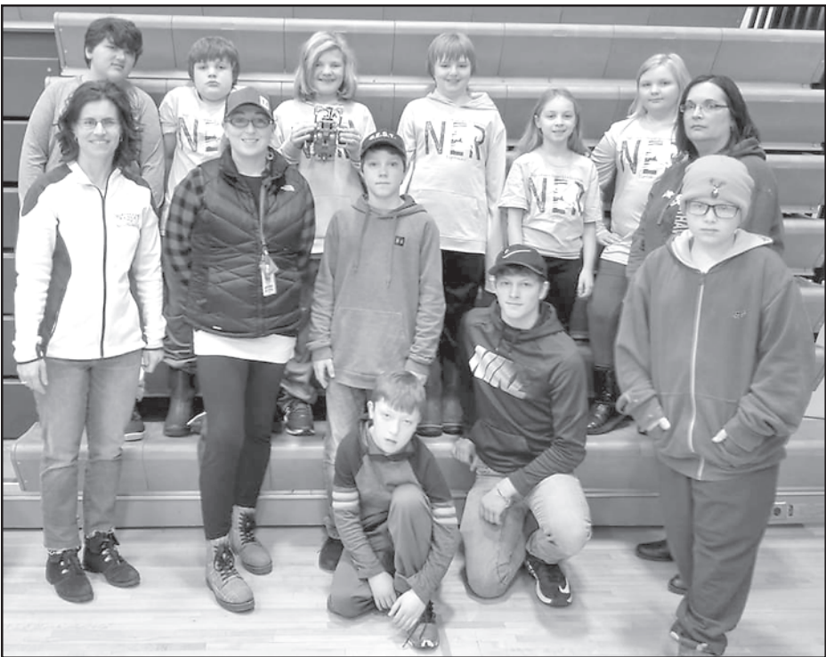
The Northeast Range Lego League full team.