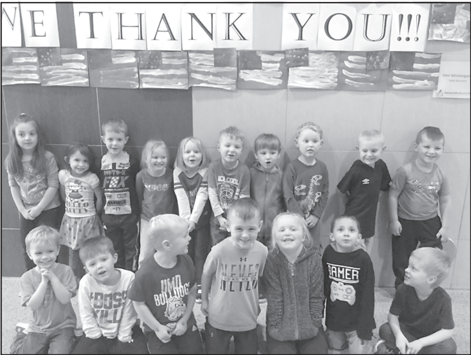
Cherry preschoolers stand by their art work showing thanks to our Veterans. The students' flags were displayed around a sign that read, "Red White Blue, We Thank You!!!"