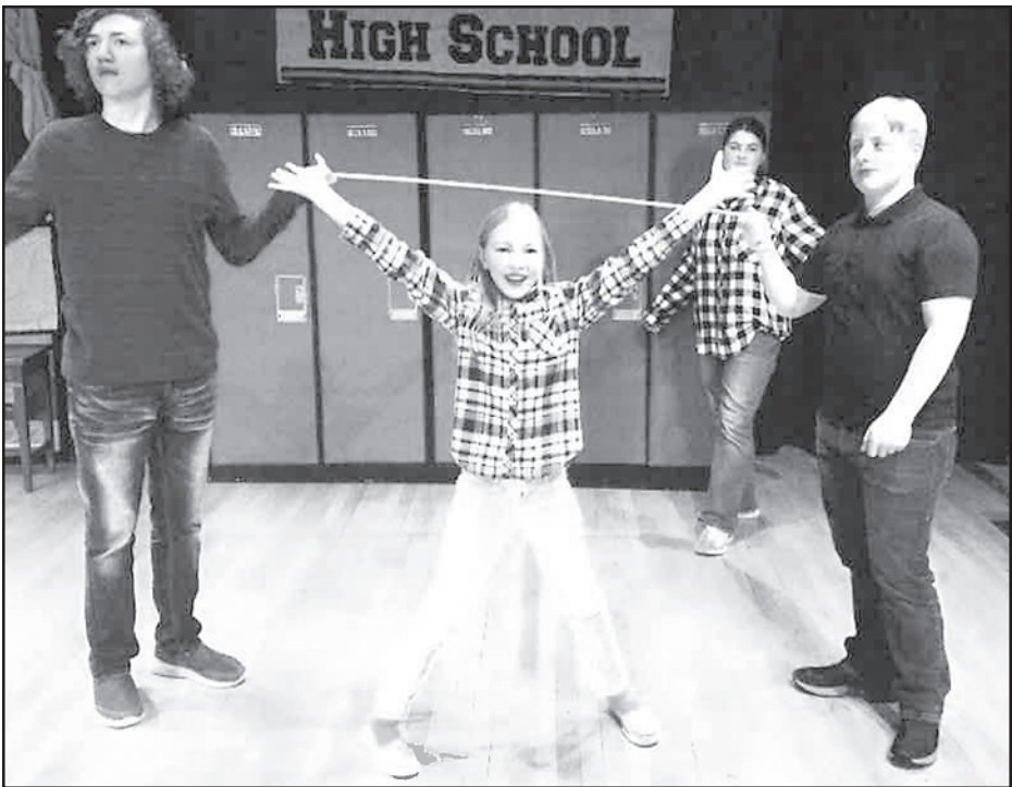
Students participate in the limbo during the performances of “Humbug High.”