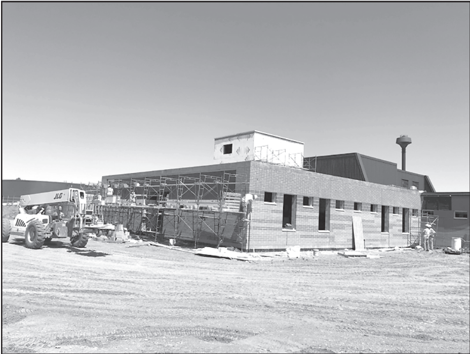
Two of three additions at the South Ridge Campus are to be complete by the end of August.

“We are excited about the expansions at both schools,” said Engebritson. “We have only been able to offer 24 hours of pre-school programming for our area 3-year-olds. With the expansion at South Ridge, we